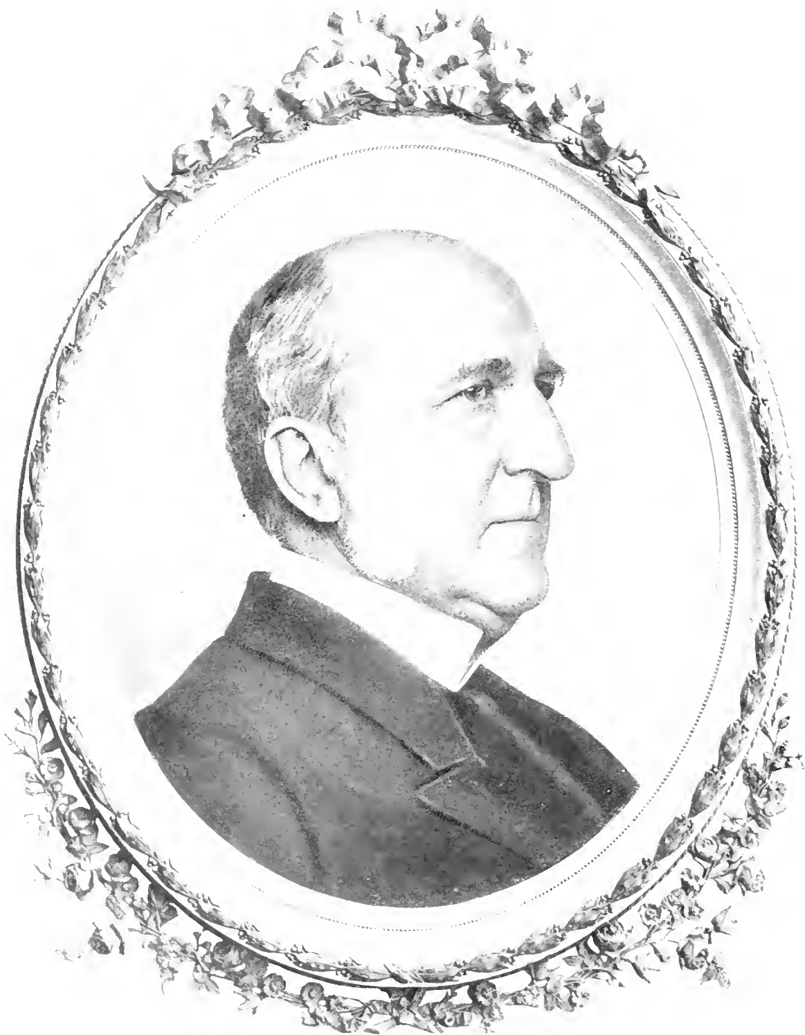
Chauncey M. Depew.